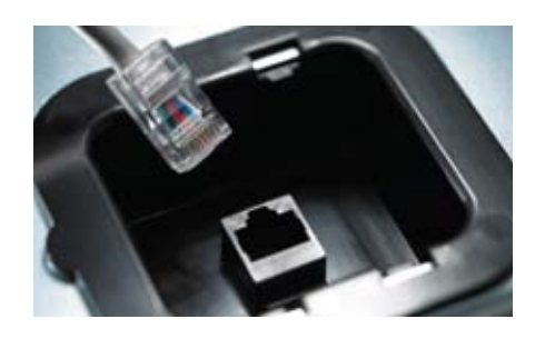
a | MultiPRO® Interface The MultiPRO interface adapts to most POS platforms.