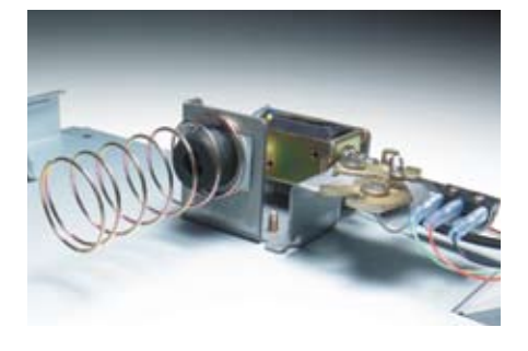
Latch Ejection Mechanism Tested over one million cycles to ensure a longer lasting drawer.