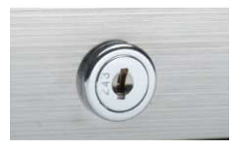
b | Four-Function Lock Proven four-function lock offers several levels of security: locked closed, locked open, online, manual open.

Choose between dual media slots, nonmedia front, and push button opening.