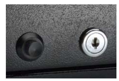
Manual Open Latch Push button operated only.