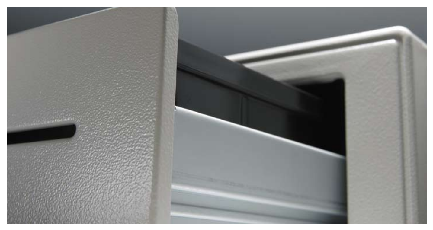
Robust features, best in class performance.