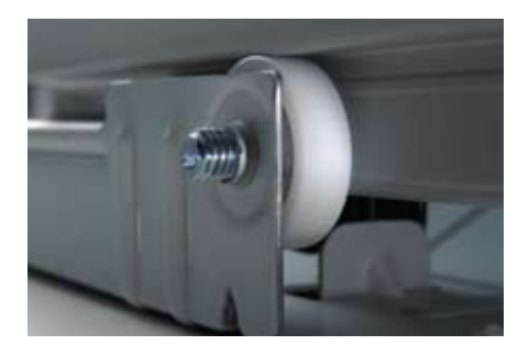
Roller Bearing The roller bearing suspension system provides long lasting performance.