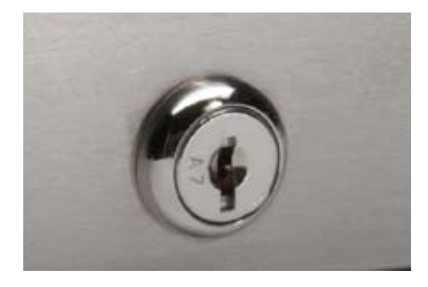
c | Four-Function Lock Proven four-function lock offers several levels of security: locked closed, locked open, online, manual open.

e | Industrial-Grade Steel Ball Bearing Slides