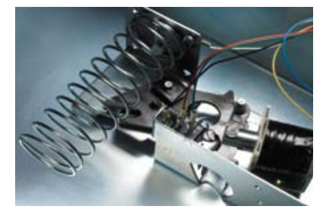
Heavy Duty Latch Mechanism A perfect balance between ease of operation and robust construction.

Sturdy steel, durable plastics and a resilient powder coated painted finish are able to resist the toughest environments.