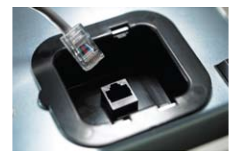
b | MultiPRO® Interface The MultiPRO interface adapts to most POS platforms.

e | Industrial-Grade Steel Ball Bearing Slides