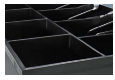
Heavy Duty Till Equipped with strong dividers and comfort coated holdowns.