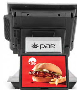
5x7" Card Holder