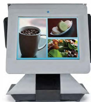
12" Customer Display