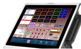
Projected Capacitive & Resistive

15" True Flat Projected Capacitive (multi-touch), Surface Capacitive, True Flat 5-Wire Resistive