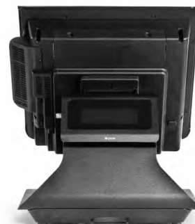
4x20 VFD Display